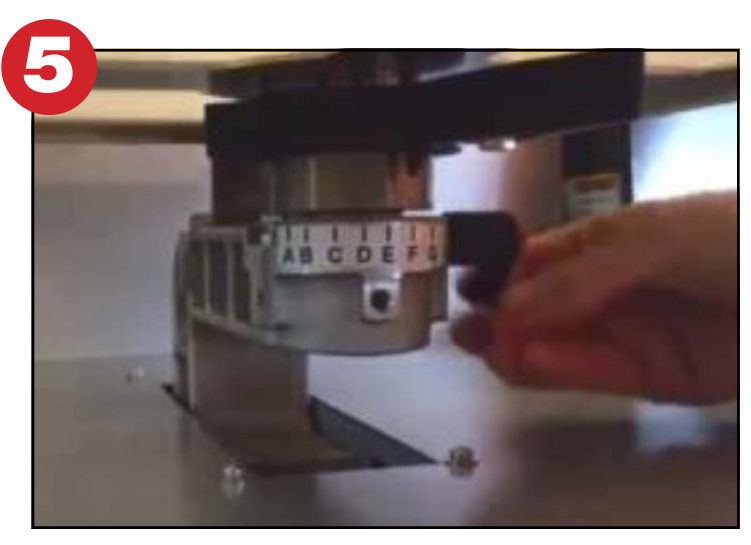
Step 5: Adjust the height of the platen to the desired position and tighten Locking Lever.