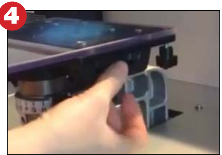
Step 4: Secure the Platen Insert by rotating the center piece in the T-Lock brackets.