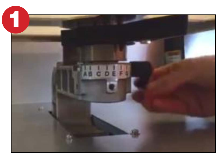
Step 1: Remove the Adult Platen by loosening the Locking Lever and lifting the platen straight up.

Below are instructions for installing the Oversized Platen Insert on your T-Lock Base.