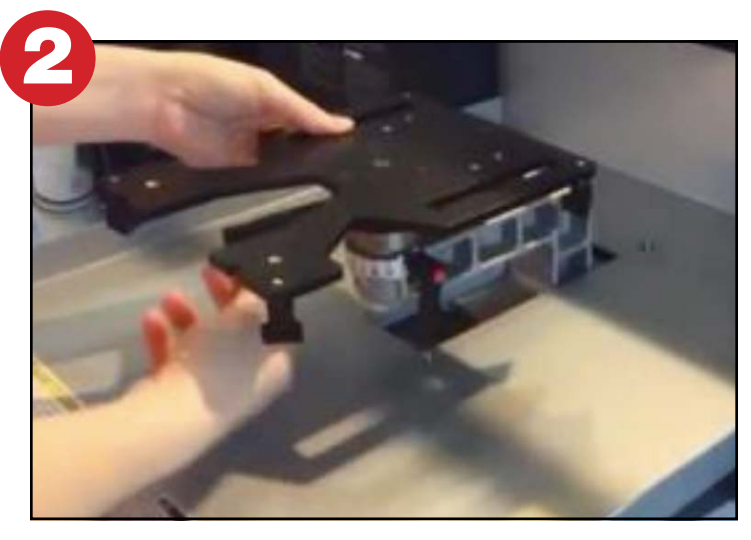
Step 2: Insert the T-Lock Base into the platen stem of the Brother DTG printer.